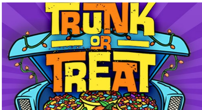
UCC Trunk or Treat